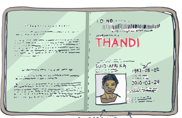
18 YEARS OLD PASSED GRADE 12 IN 2010

The current skills development system is not equipped to tackle the growing vulnerability that comes from more workers being in smaller firms and on less secure contracts. The programme operates at a small scale, despite there being adequate financial resources to expand. For example, at the end of the 2010/11 financial year there was an estimated R3.8 billion surplus from the skills development levy.